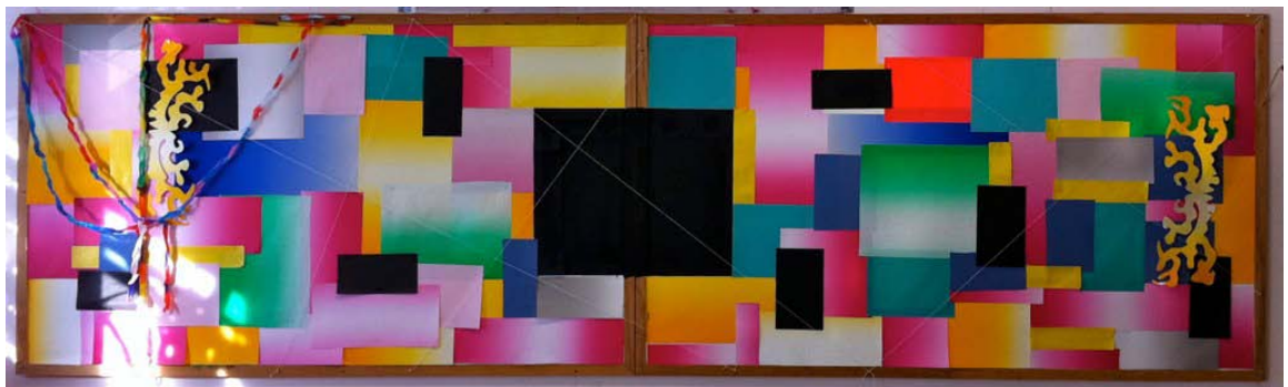
“Annihilating Black Square of Thanatos Mural”

Bad Breast Collage: Symbolic image of condensed and merged self & object representations